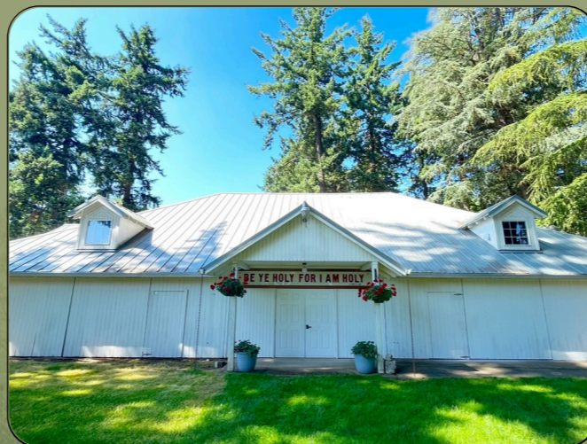
Lund Memorial Tabernacle