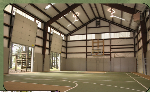
Belcher Heritage Center (Gym)