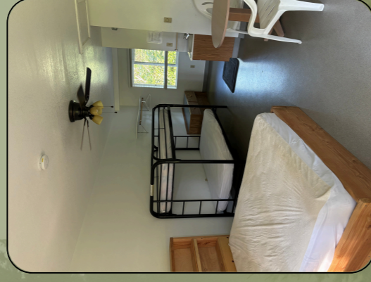
Row Cabin: Inside