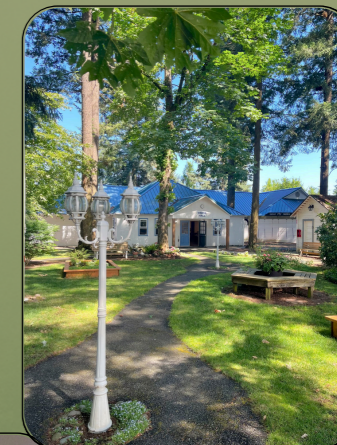
Courtyard leading to Dining Hall