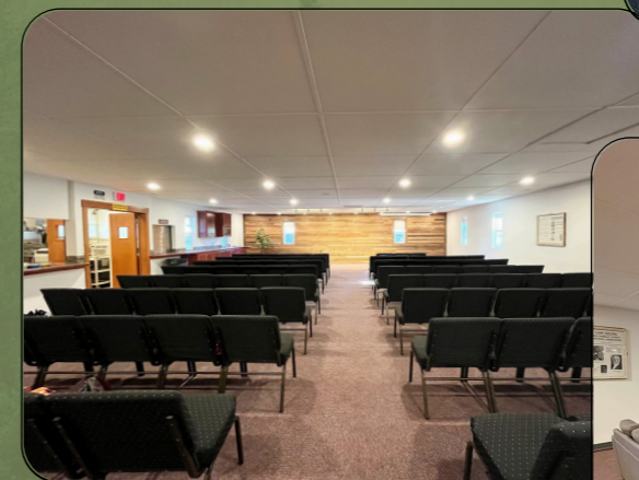
Multi-purpose Dining Hall

CHAPEL SEATING CAPACITY (WITH FIREPLACE): 150